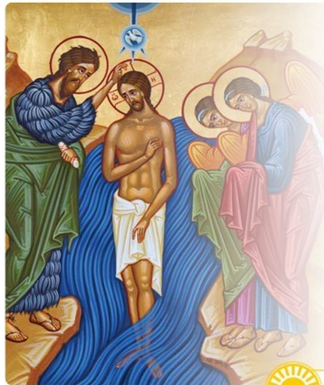
Baptism of Christ. Chapel of the Convent of the Holy Trinity in Lomnica, Vranov, Slovakia.

18-25 January: Octave of Prayer for Christian Unity